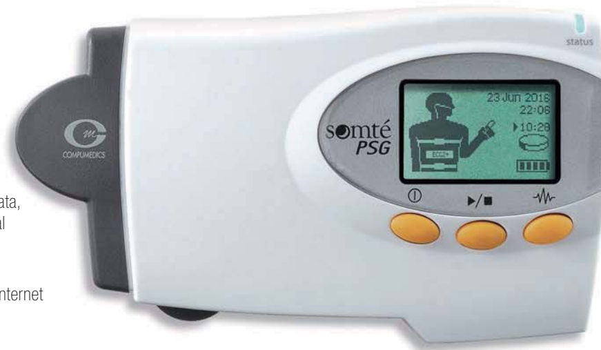
Pictured actual size